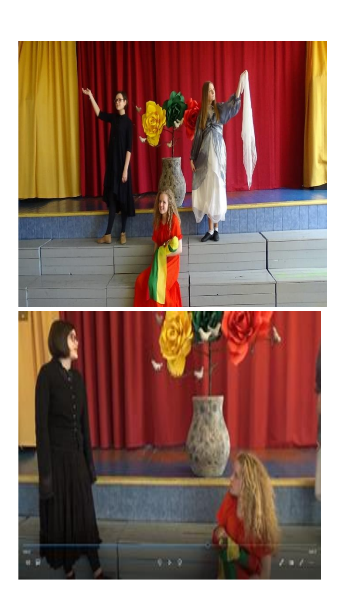
The Sun: Which fortune is waiting for this beauty?

Laumes (witches predicting the fortune). The Evil Laume and The Good Laume appear.